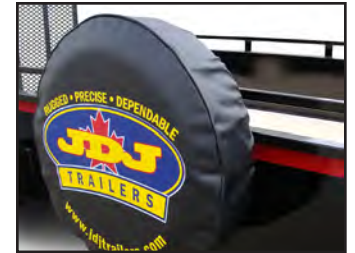
➤ Mounted Spare Tire