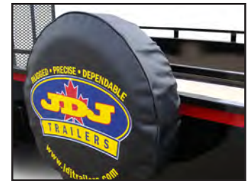
➤ Mounted Spare Tire